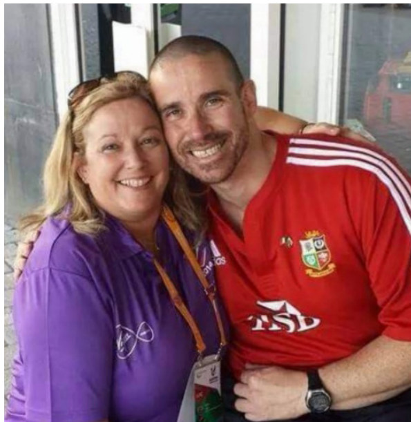
A chaplain at work

A Sports Chaplain offers a non-judgemental listening ear in total confidence. Someone you can talk to about anything - yes anything!